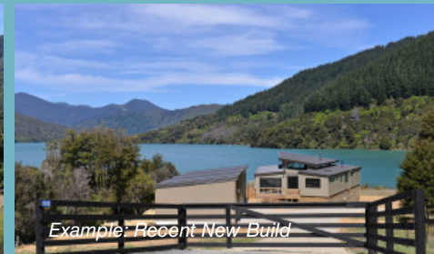
Example: Recent New Build