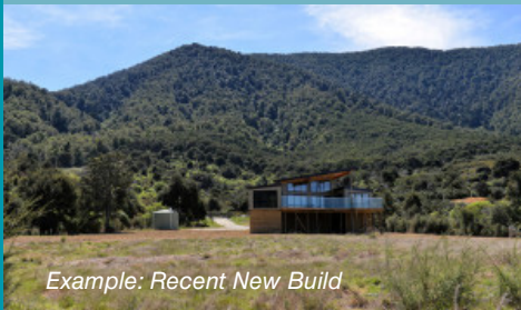
Example: Recent New Build